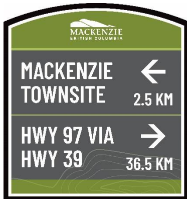
Figure 2: Standalone style – 5ft by 5ft