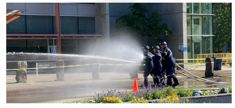
Mount Milligan Mine rescue team members in action during a training scenario at the 2025 BC Provincial Mine Rescue and First Aid Competition, held June 6-7, at the Britannia Mine Museum in Britannia Beach, BC.

Their swift, professional response is a strong reminder that mine rescue teams are always ready — not just on site, but wherever they're needed. Their actions reflect the true spirit of mine rescue, and their peers across the province are proud.