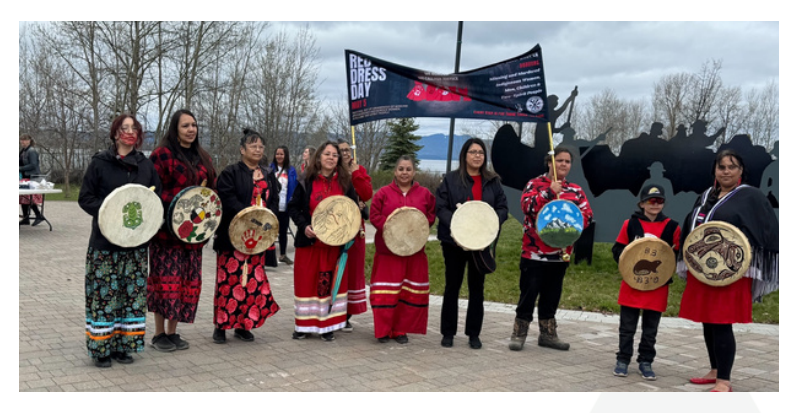
Nak'azdli Whut'en Drummers gather at Spirit Square to honor Red Dress Day in Nak'azdli Whut'en.