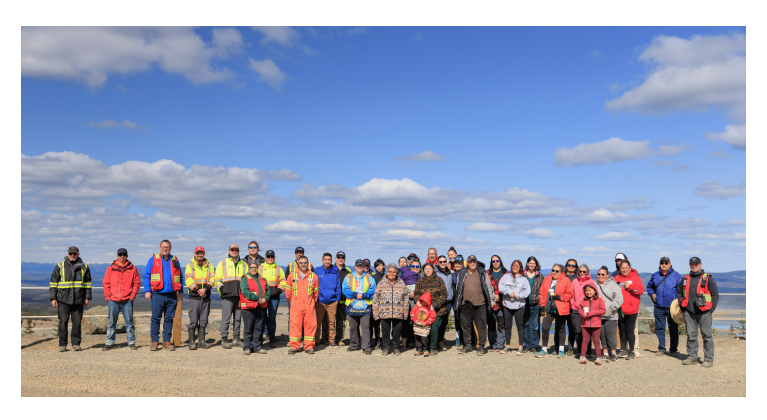
Participants from McLeod Lake Indian Band, Nak'azdli Whut'en First Nation and site employees gather at Mount Milligan.