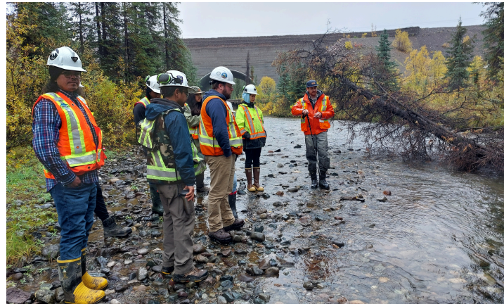
Onsite consultants Chu Cho Environmental speaking to the annual Bull Trout spawning bed counts in Kemess and Attichika Creeks during an Environmental Monitoring Committee tour of Kemess' aquatic monitoring programs.

By 2014, the Kemess Mine completed the habitat compensation features outlined in the FCA, including the construction of a fish ladder to facilitate upstream fish access. Since 2018, Chu Cho Environmental, a company owned by the Tsay Keh Dene Nation, has been actively monitoring the effectiveness of these fisheries' compensation projects. The primary species studied are Bull Trout and Dolly Varden. Overall, juvenile fish studies have demonstrated significant success, showing that fish density for both species is above average, and spawning bed counts have shown a consistent upward trend, nearly doubling over a six year period.