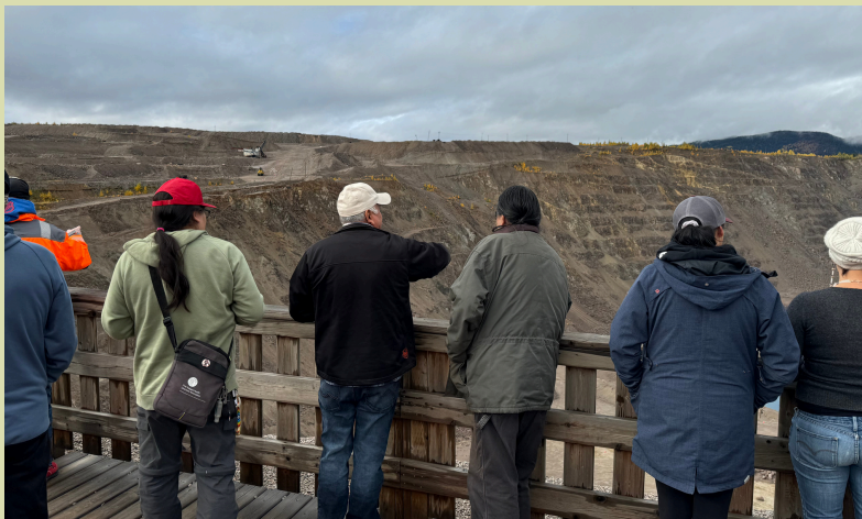
Members of Stellat'en & Nadleh Whut'en First Nations during a site tour of Endako Mine in October.