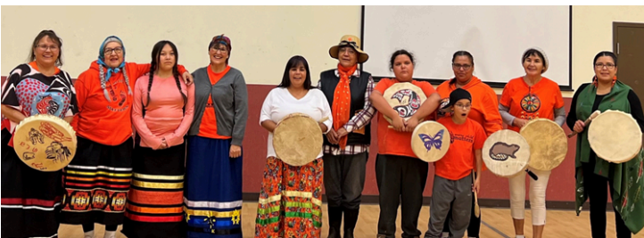
Nak'azdli Whut'en Drummers provided an evening performance at Mount Milligan mine site, September 30.

The Social Performance team attended a community gathering at Lejac Residential School and Nadleh Whut'en, just west of Fort Fraser BC. Youth from the Indigenous communities in the vicinity of all three of Centerra's BC mine sites would have typically attended Lejac. Students from over 72 communities, within Northern BC and Alberta attended the school.