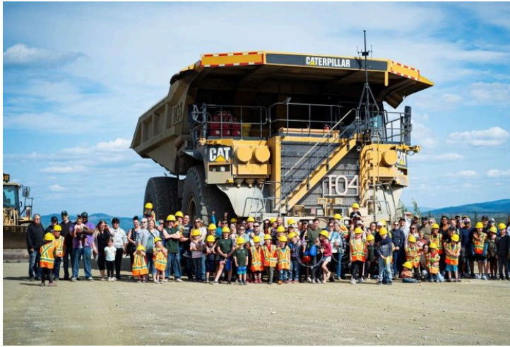
Families enjoying one of two Family Day events held on-site.