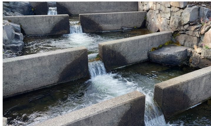
The Kemess fish ladder eases fish travel upstream to reach spawning beds.